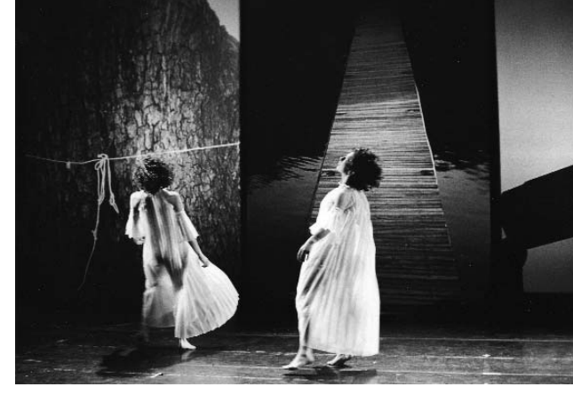
Trisha Brown, Glacial Decoy, 1979.

the development of experimental forms of documentary recording (together with the traditional medium of drawing) or the use of kinetic experiments in minimalist sculpture and video installations. These are all aspects determining the main and secondary strands of the exhibition.