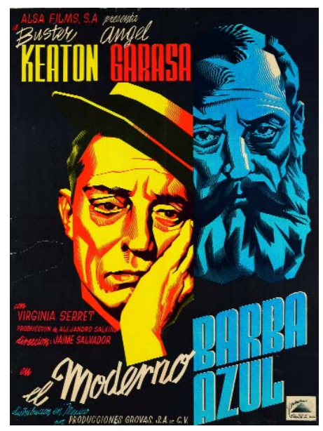
Poster for the film A Modern Bluebeard, 1946, 97 x 70.5 cm print

landmarks in the history of Spain are represented allegorically.