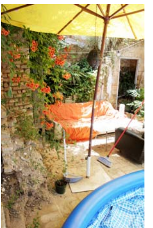
La sombrilla en el patio, 2008