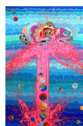
Time's Up. 2008